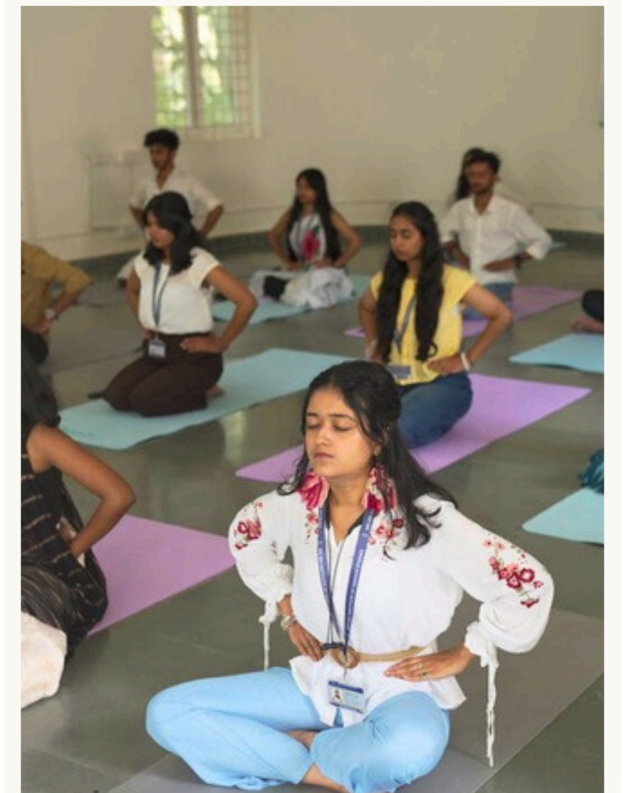
Yoga & Meditation Room